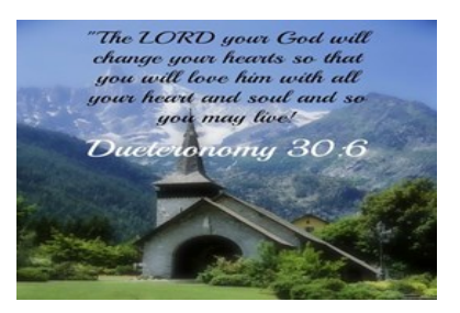
Prayer is at the heart of our beliefs

Pastor's Book Club meets each Tuesday at 12Noon for fellowship, food and learning.