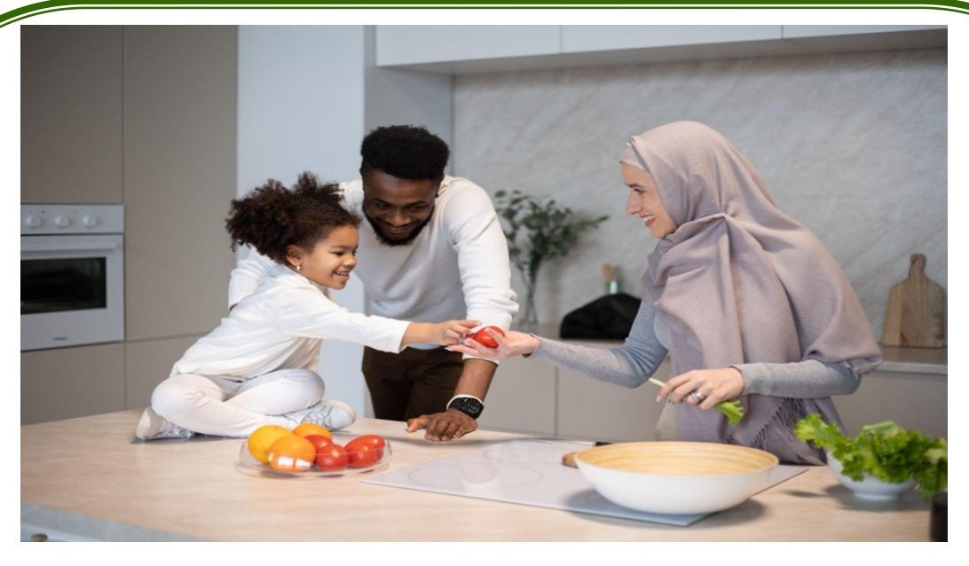
6 Approachable Health Strategies for The Whole Family

If you're like most parents, you want everyone in your family to lead happy and healthy lives. But too often, maintaining optimal health can feel like an overwhelming task. How can a busy family like yours find the time to ensure everyone eats well, exercises often, and gets enough sleep? And even if you're running on all cylinders trying to meet these health goals, you'll never get time to relax and practice some much-needed self-care. Good health is about moderation and balance. If you want your family to maintain healthy habits in the long run, stick to approachable health strategies that can easily be incorporated into your everyday life. Here are some tips from Asbury to get you started.